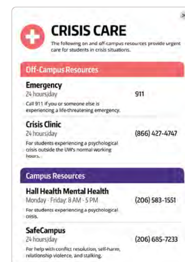
Crisis Care Pop-up